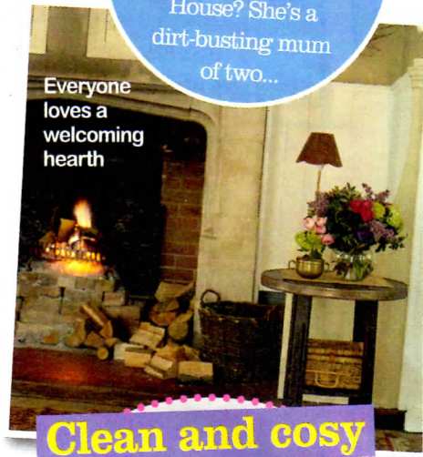
Everyone loves a welcoming hearth