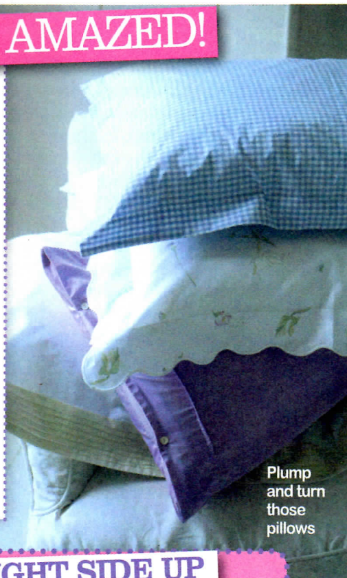
Plump and turn those pillows

B est reader Bernadette Caverter makes sure her white bedding looks pristine, until the next change of linen, by turning her pillows over each night. In the morning, she turns them back over again. No greasy stains, dribble marks or mascara smudges are visible with this routine!