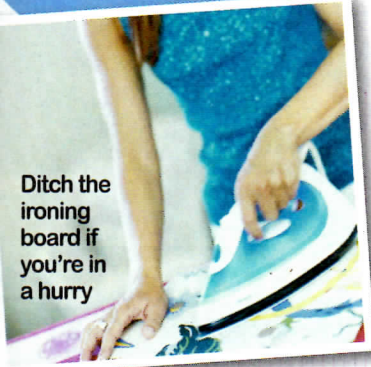
Ditch the ironing board if you're in a hurry

Sometimes when you're in a rush and need to iron one item quickly, it's such a faff setting up the ironing board. This heat-resistant mat from Lakeland (£7.99) is brilliant – just lay a towel underneath it and off you go.